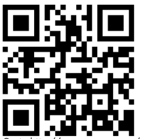
Go to http://www.cwcusa.org/ or scan this QR Code with your smartphone for more information about this organization.