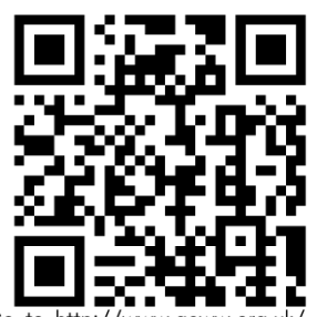
scan this QR Code with your smartphone for more information about this organization.