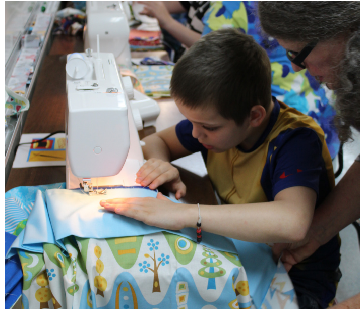
KEHA members in Metcalfe County teaching sewing skills to youth as part of a summer day camp, enabling the youth to make 40 pillowcases for the Center for Courageous Kids.