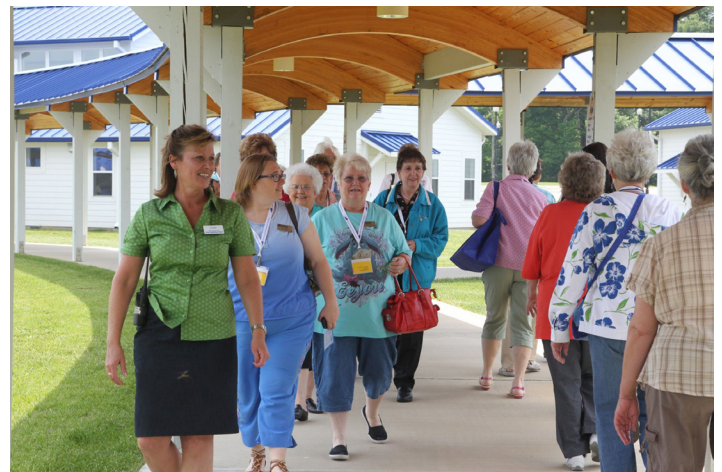
Members of the Kentucky Extension Homemakers Association tour the Center for Courageous Kids.

KEHA is a volunteer organization that works to improve the quality of life for families and communities through leadership development, volunteer service and education in partnership with Kentucky Cooperative Extension. Building a strong future for Kentucky youth is an important part of the organization's focus.